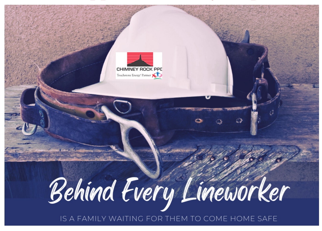
Celebrating our linemen and their families #ThankALineman